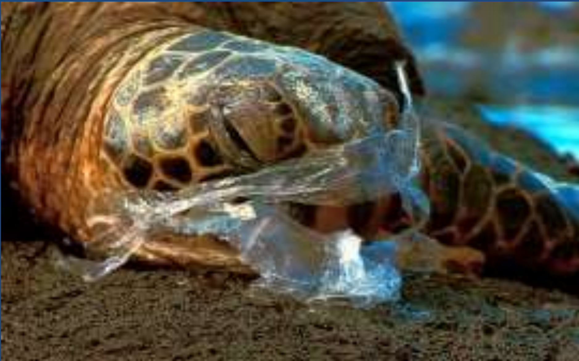
Greenhouse Carbon Neutral Fdn