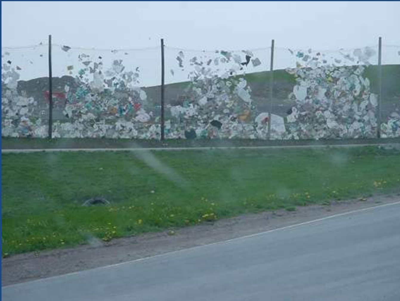
A "bag fence" at a landfill northern NY