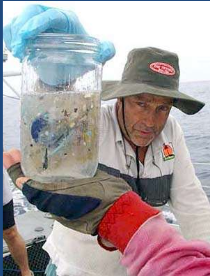
Algalita Marine Research Foundation

Plastics and plastic bags don't decompose. Instead, they break down into smaller and smaller bits